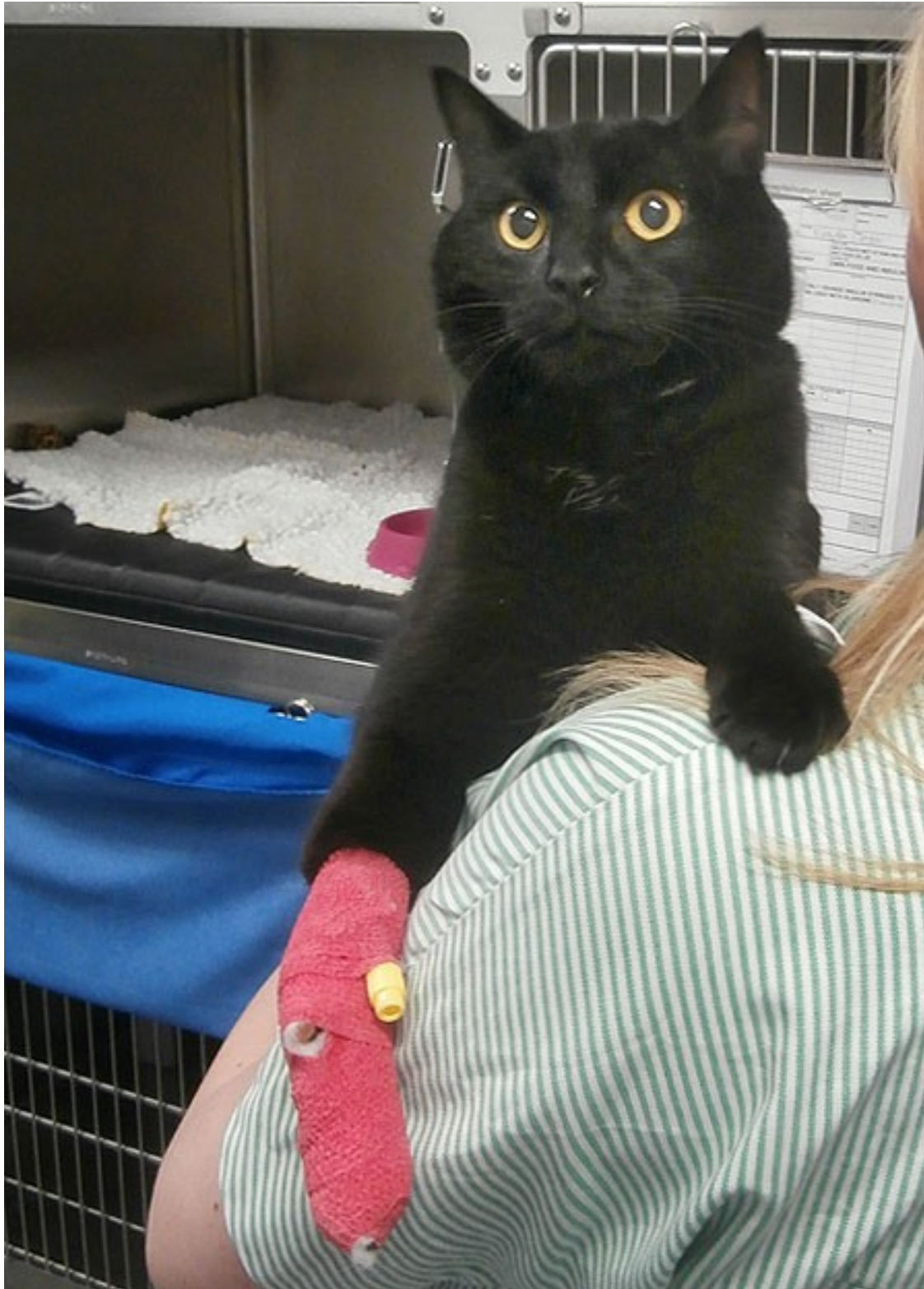
Marmite after his operation

X rays were taken after surgery and showed good alignment of the broken bones